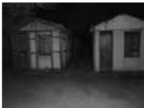
Figure 001 Leakey's camp structures.