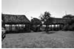
Figure 005 Lecture venue.