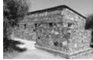
Figure 006 Washroom facility.