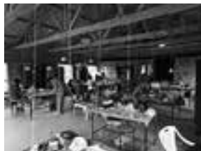
Figure 002 New site laboratory.