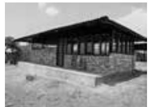
Figure 003 Aguirre-Mturi station.

The current museum’s facilities at Olduvai include the information center built by the Leakey’s in 1970 and opened to the public in 1972 (Paresso, personal communication) and was later expanded through the construction of adjacent hall by the Getty Conservation Institute in 1966 (Kimambo, 2014). The museum complex includes orientation room, Olduvai and Laetoli room (Fig. 004), two lecture venues (banda in Swahili) (Fig. 005) and newly constructed washroom facilities (Fig. 006).