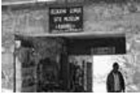
Figure 004 Museum entrance.