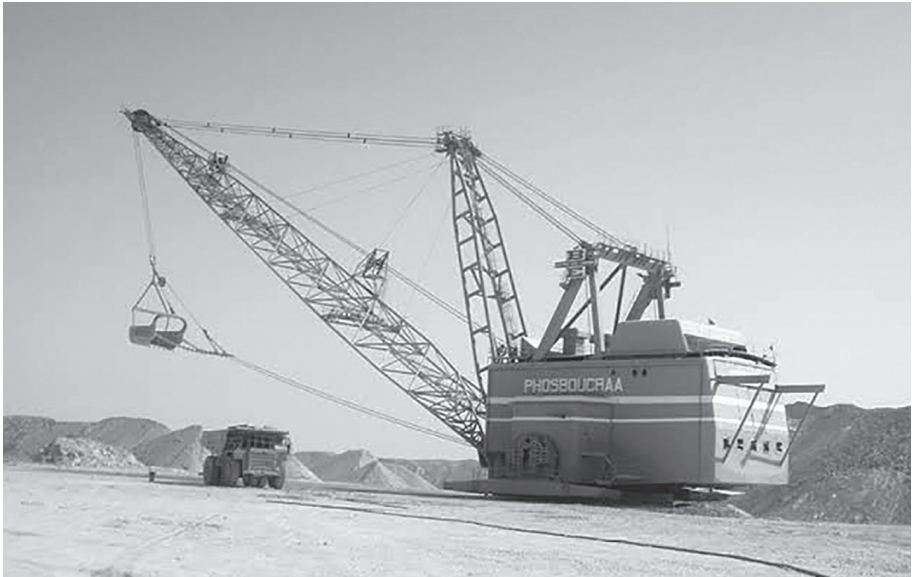
Ilustração 01 – Exploração de fosfatos 1973.

_____. «中华人民共和国和摩洛哥王国关于建立两国战略伙伴关系的联合声明» (May 11, 2016), Xinhua.net . [Consult. 23.Feb.2019]. Available at: http://www.xinhuanet.com/politics/2016-05/11/c_1118849465.htm .