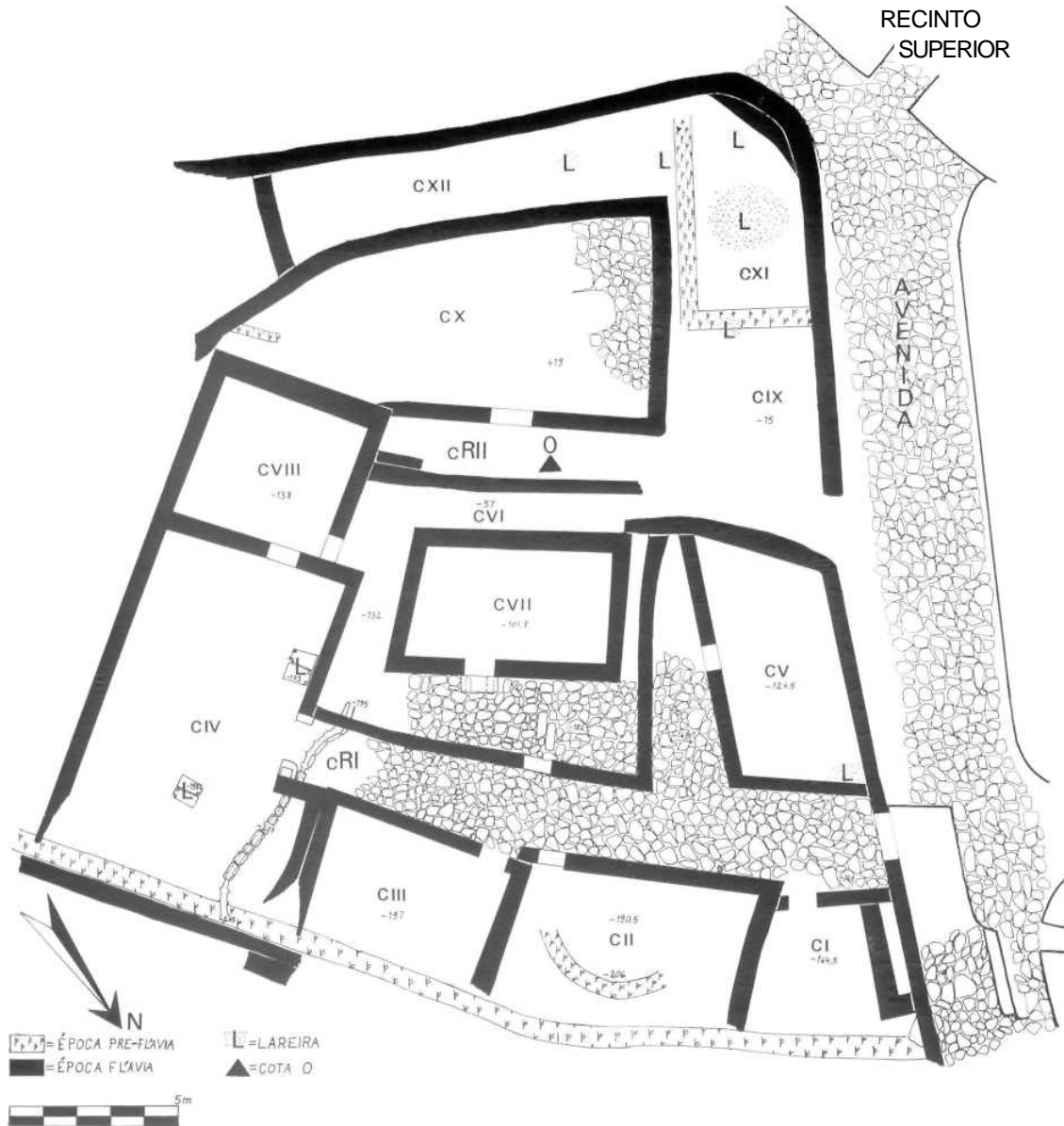
Aspecto geral do conjunto